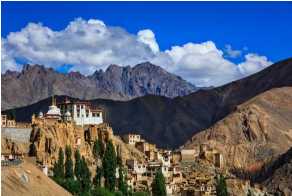
The different landscapes of Ladakh & Kashmir

Our journey through two very different faces of India will take us from the wondrous pine forests and green flowered meadows of Muslim Kashmir to the rugged beauty of raw barren Buddhist Ladakh, Only an overland road trip can do justice to this trip as you will see the drastic change from upper to lower Himalayas, and that is what we will do!